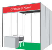
Shell Scheme Stall