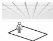
Raw (bare) Space (Inside hall)

Shell Scheme includes: floor rental, back and side walls, fascia board with company name, one table, two chairs (per 9 Sqm.), 3 spot lights, electric point (300 watts single power socket per booth) and carpet.