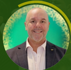
TODD MILLER High Commissioner Australian Trade and Investment Commission (Austrade)