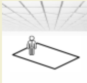
Raw (bare) Space (inside hall)

Shell Scheme includes: floor rental, back and side walls, fascia board with company name, one table, two chairs (per 9 Sqm.), 3 spot lights, electric point (300 watts single power socket per booth) and carpet.