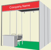
Shell Scheme Stall