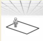
Raw (bare) Space (Inside hall)

Shell Scheme includes: floor rental, back and side walls, fascia board with company name, one table, two chairs (per 9 Sqm.), 3 spot lights, electric point (300 watts single power socket per booth) and carpet and company entry in the official show catalogue/magazine.